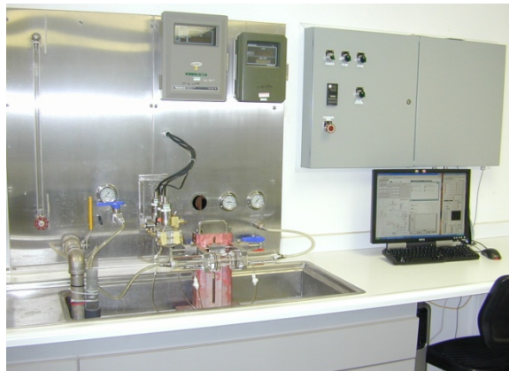
Figure 3 – Automatic Water Tester

Utilizing the same concepts as the air tester, Vernay's water test machine (Fig. 3) produces the same differential pressure verses flow curves on elastomeric check valves, as well as flow control products, using water as test media.